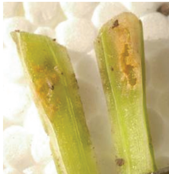
Figure 2. Feeding tunnels of P. chrysocephala larvae in oilseed rape leaf petioles, 30 November 2010

During November, adults were noticed on the ground around oilseed rape plants, which indicated egg laying. The first sampling and dissection of leaf petals were done on 10 November 2010 (BBCH 17-18). Dissection data showed that larvae were at the beginning of development (L1) and that sampling and dissection were performed too early. The second sampling and dissection were conducted on 30 November 2010. The results of dissection revealed that 76% of the plants in the organic field were infested, while 31% of leaf petioles contained P. chrysocephala larvae (Figure 1). In the integrated field, 44% of the plants and 14.5% of all dissected leaf petioles were infested. In the conventional field, no infested plants were recorded. Due to damaged leaves, plants were not able to successfully overwinter. In the organic field, which was most infested, the number of plants in the spring was reduced by 51%, from 43.0/m 2 to 22.0/m 2 , while a reduction did not occur in the conventionally managed and integrated fields, where the numbers varied from 30.3/m 2 to 30.5/m 2 , and 31.2/m 2 to 35.0/m 2 , respectively.