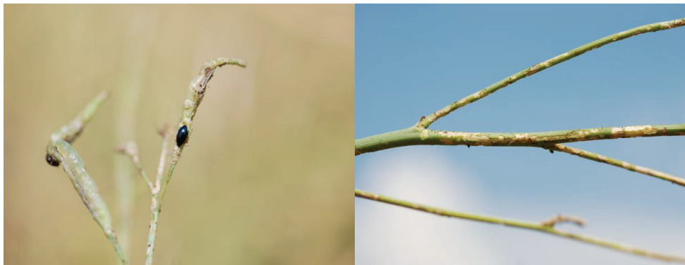
Figure 5. New generation of P. chrysocephala feeding on oilseed rape husks and branches, June 2011