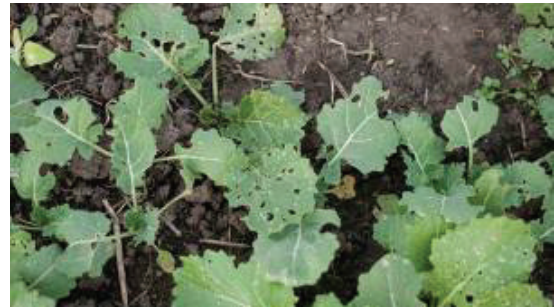
Figure 3. Feeding scars on oilseed rape and turnip rape leaves, October 2010

can be used as a trap crop for management of this pest. In July no emergence or flight of beetles was recorded. Photoelector cages were left in the field throughout a fallow and further on during the following year, when an emergence of as much as 0.5 beetles/m 2 was recorded in the most infested organic field on 5 March 2012, while 0.81 beetles /m 2 were found in the trap crop.