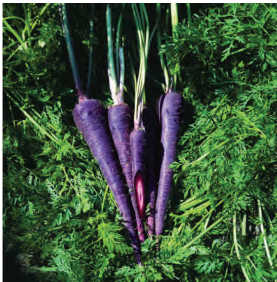
Figure 1. Daucus carrota cv. 'Vizija'

Stimulation of carrot seed germination by Pseudomonas strains and difference between seed germination induced by each strain and the control sample is shown in Figure 2 and Table 1. P. chlororaphis Q16 induced a statistically significant increment in seed germination for all applied fractions and in both incubation periods. The weakest seed germination potential was observed in Pseudomonas sp. Ek1, showing the same or lower values than control samples when culture or CFSa (II) were applied.