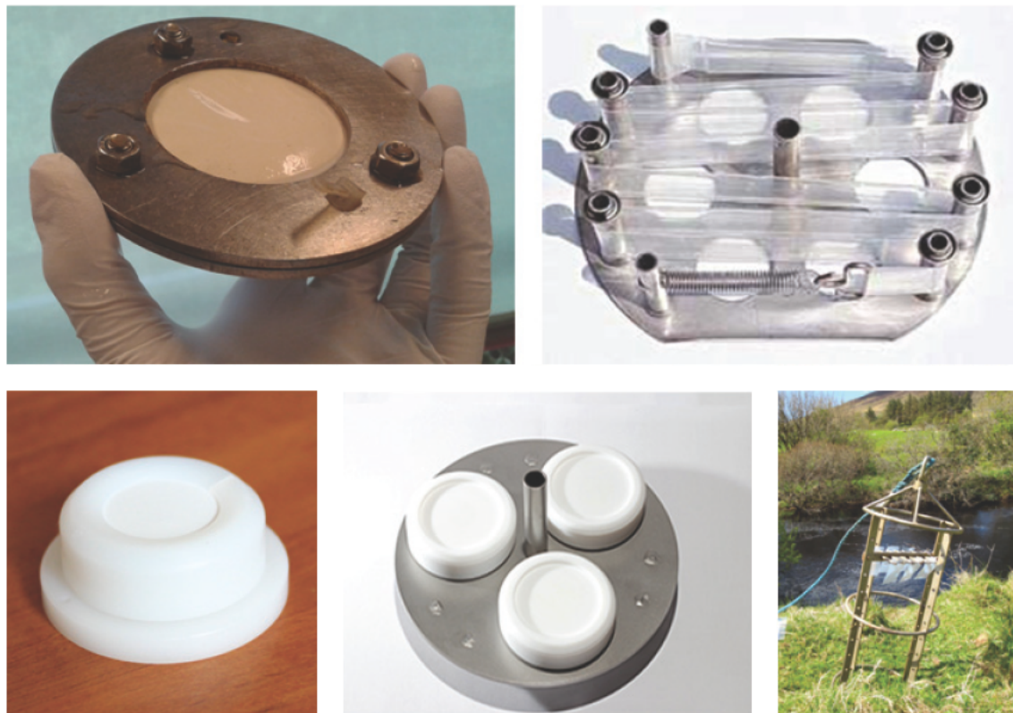
Figure 1. Passive sampling devices

To enable separation of a compound of interest out of a sorbent to the greatest possible extent, methanol and a mixture of dichloromethane and acetonitrile are used as eluents (Sun et al., 2008) or a mixture of acetone and methanol. One of the most important procedures that precede extraction is the adding of isotopically labeled internal standard to the sample (Loos et al., 2010).