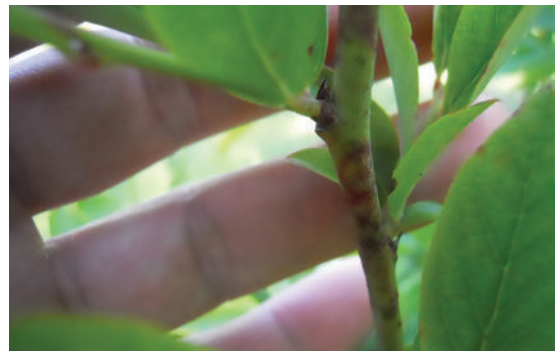
Figure 4. Reddish blotches on blueberry stem caused by Blueberry red ringspot virus