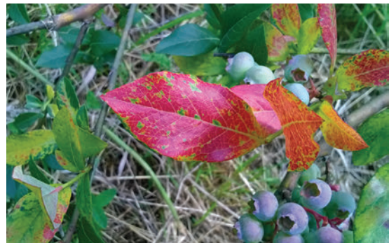
Figure 3. Mosaic symptoms on blueberry leaves – yellowish and dark red mosaic pattern induced by Blueberry mosaic-associated virus