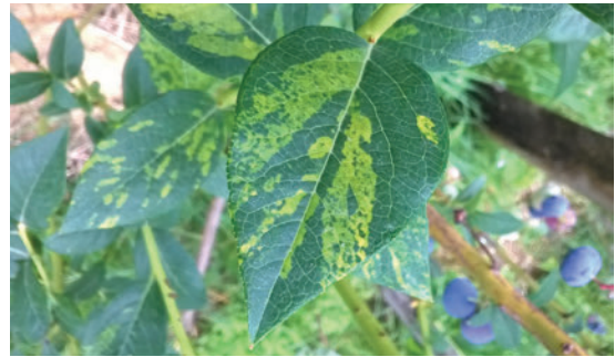
Figure 2. Mosaic symptoms on blueberry leaves – light green mosaic pattern induced by Blueberry mosaic-associated virus

During inspection, a majority of plants in the surveyed plantations did not show any symptoms indicating virus presence. Symptoms typical for blueberry mosaic disease were observed on the leaves of 7 plants on 2 locations. The plants showed yellow, red, yellowish green or white mosaic pattern on leaves (Figures 2 and 3). No other symptoms on stem or fruits were found on these plants. One plant showed reddish blotches on stem indicating the presence of BRRV (Figure 4).