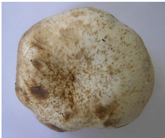
Figure 1. Sunken brown lesions on A. bisporus caps induced by P. tolaasii

Our monitoring of bacterial diseases in mushroom farms and fresh markets in Serbia revealed the presence of symptoms of brown blotch or different degrees of brown discoloration on fruiting bodies of A. bisporus (Figures 1 and 2). Over a hundred bacterial isolates were obtained after isolation from symptomatic samples. Forty-five green fluorescent, Gram negative isolates from different sources and locations were selected for pathogenicity tests. The bacterial isolates showed different degrees of discoloration and tissue degradation on the mushroom cubes, varying from light to dark brown (Figure 3). Thirty-six bacterial isolates caused sunken brown lesions on A. bisporus cap tissue blocks after 72 h, consistent with those caused by the reference strain of P. tolaasii . The remaining isolates showed light brown superficial discoloration both on tissue blocks and sporophores similar to the P. agarici reference strain.