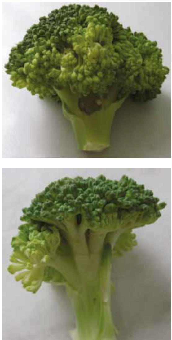
Figure 1. Pathogenicity assay. Tissue discoloration and soft rot of broccoli floret inoculated with one of the studied strains (above), and no symptoms developed on negative control (below) 48 h after inoculation.

Symptoms of tissue discoloration and soft rot of broccoli florets developed within 48 to 72 h after inoculation (Figure 1). No symptoms developed on control florets. Soft rot appeared on the inoculated carrot and potato tuber slices 24 h after inoculation, indicating a strong pectolytic activity of the studied strains. The strains did not induce hypersensitive reaction on tobacco leaves.