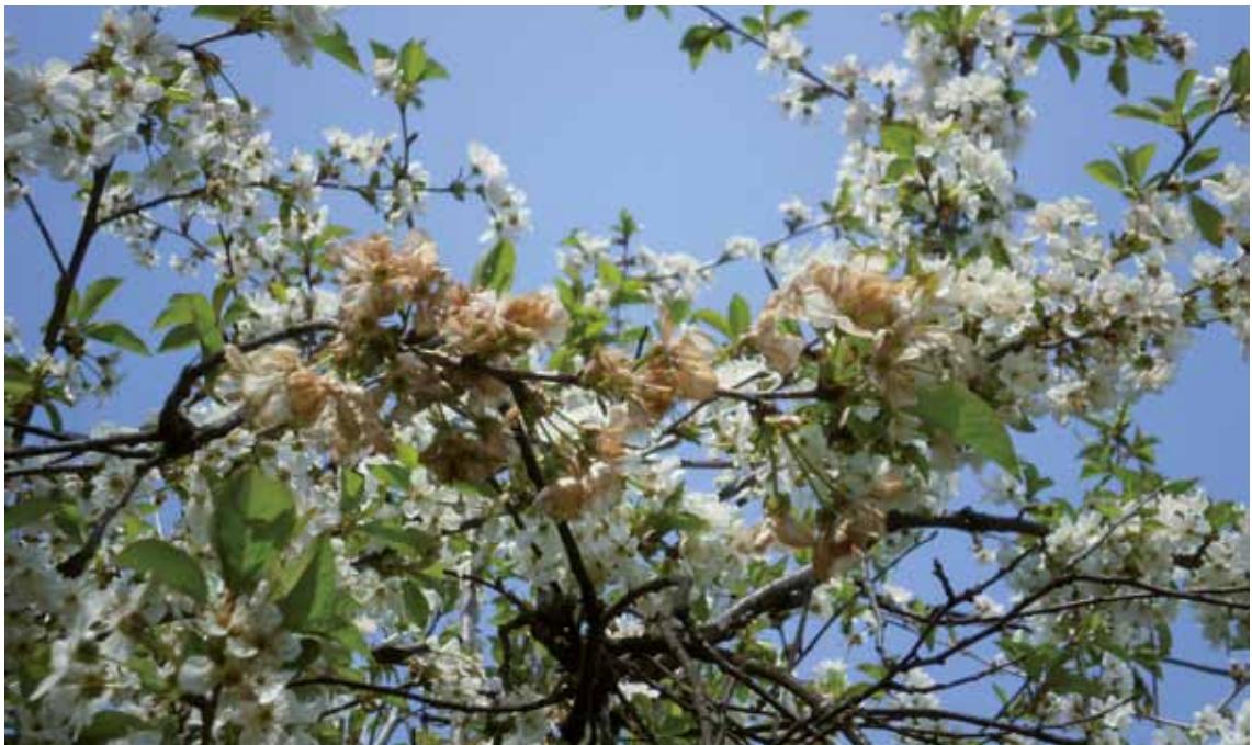
Figure 1. Monilinia laxa : blossom blight on sour cherry

on pome and stone fruits every year, causing particularly high yield losses when rainy period coincides with blooming and fruit ripening (Hrustić et al., 2010, 2012). As a consequence of blossom blight and fruit rot, losses in stone fruit production can reach 100% (Balaž, 2000), while 5-25% of infected fruits become additionally devastated after harvest (Ivanović and Ivanović, 2001). M. fructigena has been found in apple storages with a share of 14.4% compared to the other pathogens (Hrustić et al., 2012a).