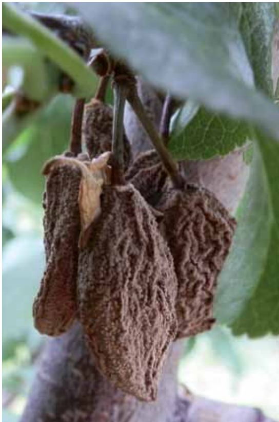
Figure 3. Monilinia laxa : mummified plum fruits

Among stone fruit species, apricot is the most susceptible to blossom blight, followed by sweet cherry, peach, sour cherry and plum (Holb, 2008). On the other hand, damages caused by the pathogen on sweet cherries are more significant on fruits than on twigs and blossoms (Holb, 2006).