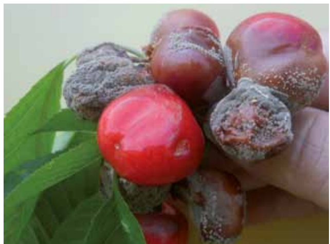
Figure 2. Monilinia laxa : plum (left) and sweet cherry (right) fruit rot, natural infection