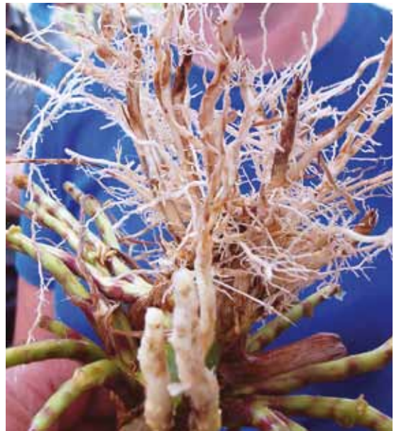
Figure 5. Feeding scars on corn root