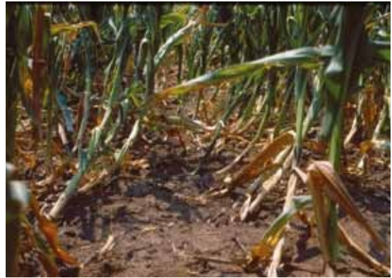
Figure 4. Lodged corn plants

Under our climatic and agrotechnical conditions, adults are sporadic pests. Adults are a threat only in cases of sowing after the optimal sowing date or in case of stubble corn sowing. Adults feed on corn pollen, silk, leaves and on young, juicy ears. Besides corn, adults can also feed on different cultivated or weed plants (sunflower, pumpkins, bean leaves, flowers of vegetables and weeds, etc.) where alternative pollen sources are available.