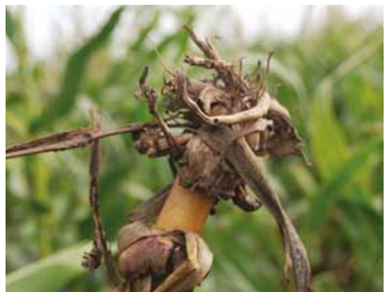
Figure 6. Heavily damaged corn root