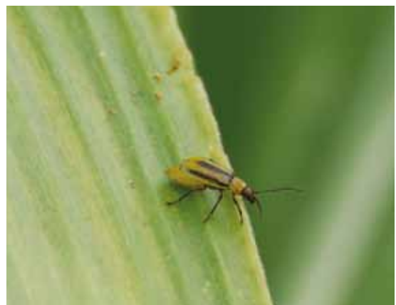
Figure 3. D.v. virgifera female on corn leaf

D. v. virgifera (Figure 3) has one generation per year. It overwinters in the egg stage. Under the climatic conditions of Serbia, larvae hatching starts around May 15 th . The highest number of larvae on roots is observed around June 20 th when feeding is most intensive and plants become lodged as they lose roots. In years with warmer springs, hatching and development start earlier, as for example in 2000 when maximum larval abundance was recorded as early as on May 31 st (Sivčev and Tomašev, 2002). Hatched specimens start to move through soil in search of corn roots. This is a critical period in their development because mortality of young larvae can exceed 90% (Toepfer and Kuhlman, 2006). Corn is a primary host for WCR larvae (Branson and Krysan, 1981; Clark and Hibbard, 2004; Wilson and Hibbard, 2004) which is why large areas under continuous corn are favorable for their survival and population growth (Hill and Mayo, 1980). Larvae pupate in soil chambers in the root zone. They remain in the pupal stage for 7-10 days. First adults emerge by the end of June. Their abundance increases during July and reaches maximum by the end of the month. From the second decade of August the abundance decreases. Adults are present in the field until first frosts (Bača et al., 1995).