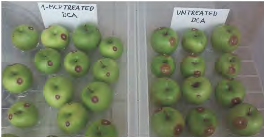
Figure 1. Necrosis development on 1-MCP-treated (left) and untreated fruits (right)

storage termination, there were statistically significant differences between treated and untreated fruits ( p < 0.01 ). On treated fruits, necrosis diameters were significantly smaller compared to untreated apples (Figures 1 and 2).