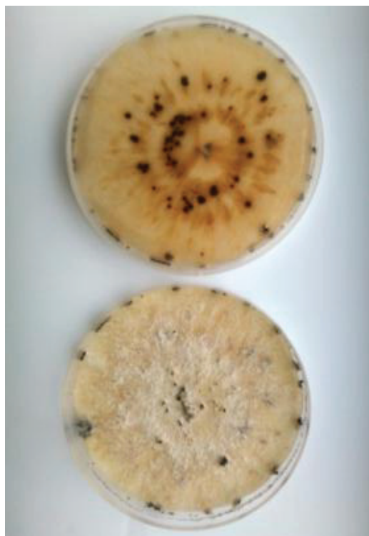
Figure 2. Colony morphology of Ph. theicola on PDA