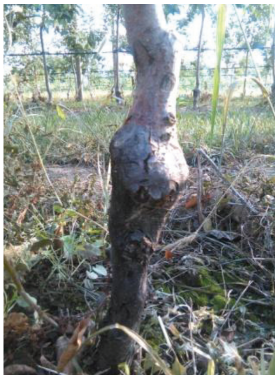
Figure 1. Symptoms of dieback and canker on an apple tree